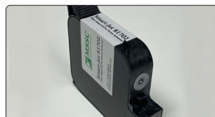
TIJ 1/2" cartridge technology