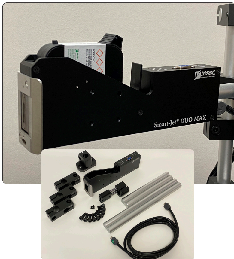
Pieces included in each printhead box