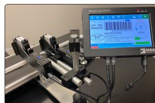
Connect up to 2 printheads at one time